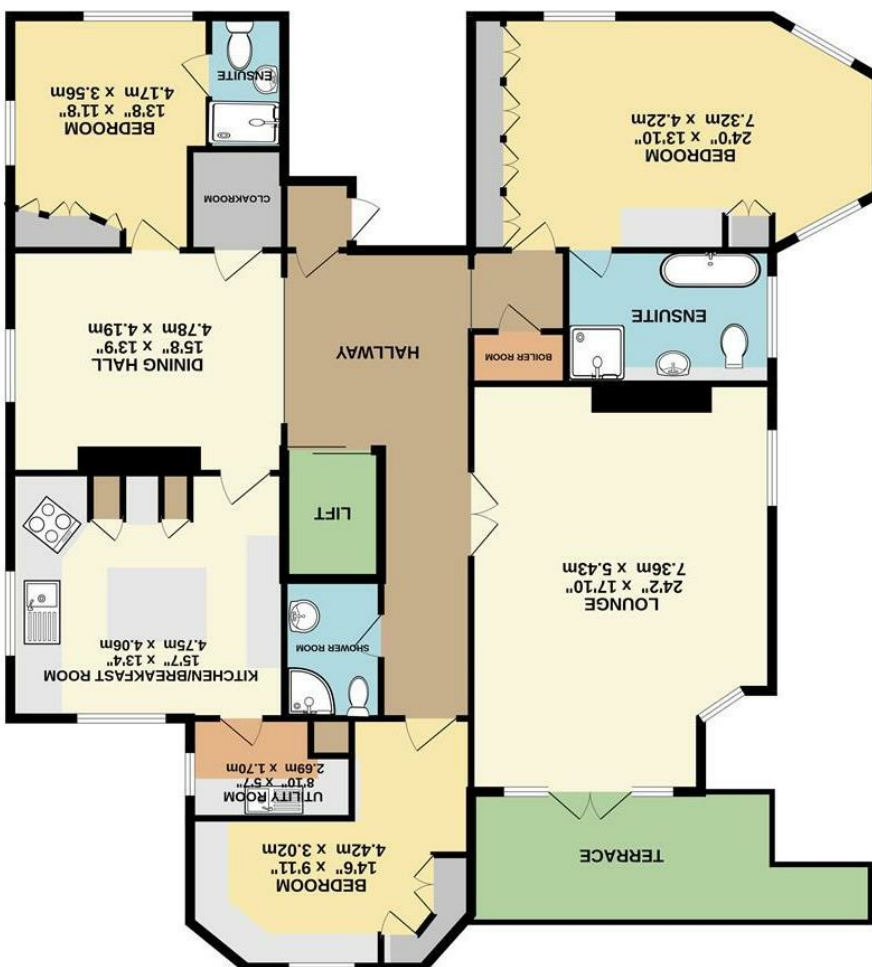
GROUND FLOOR 2087 sq.ft. (193.9 sq.m.) approx.

While every attempt has been made to ensure the accuracy of the figures contained here, measurements of doors, windows, rooms and any other areas are approximate and no responsibility is taken for any error, omission or mis-statement. This plan is for illustrative purposes only and should be used as such by any prospective purchaser. The services, systems and appliances shown have not been tested and no guarantee, as to their operability or efficiency can be given. Plans with Metretek 02025